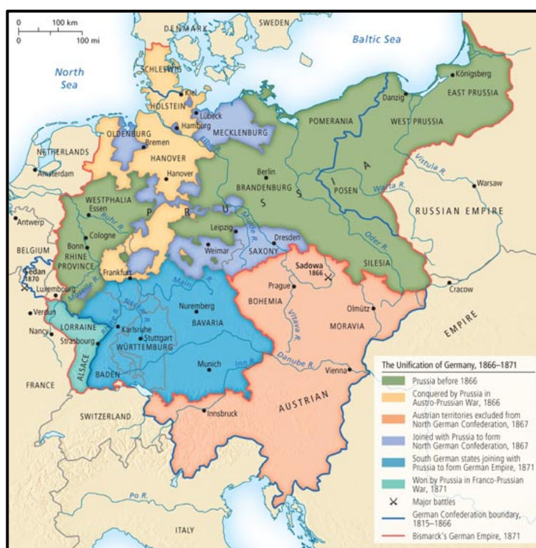
Figure 2: German Unification 1866-1871, available at Pearson Education, Inc. 23

Although it had survived largely intact, unlike the Austro-Hungarian and Ottoman Empires, the Germany that emerged from the First World War did so in somewhat truncated form from the vast central European version that existed prior to 1919. Adolf Hitler embraced this loss of territory, used it to nurse mass resentment in the psyche of the German people, and combined that with their collective memory of Lebensraum . Like Mussolini, Hitler grafted fascism onto the newly resurgent German nationalism he had stoked, but from the start, expansionism and Pan-Germanism were key elements of this notion.