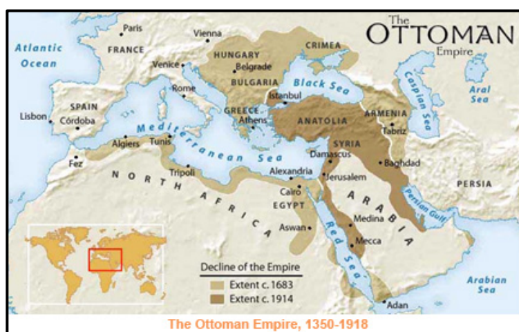
Figure 4: Geographic Contraction of the Ottoman Empire 31

Consequently, something of a perfect storm allowed Pan-Turkism to anchor itself as an organizing philosophy leading to genocidal policy. Not only was it offered as a political vehicle to enter the mainstream by the Young Turk Revolution, the actual shrinkage of the empire back to its mainly Turkish core established both a common sense argument for the popular embrace of this “Turks only” mindset but also fired the survivalist aspect of it that could then be used to rationalize the atrocities that would follow.