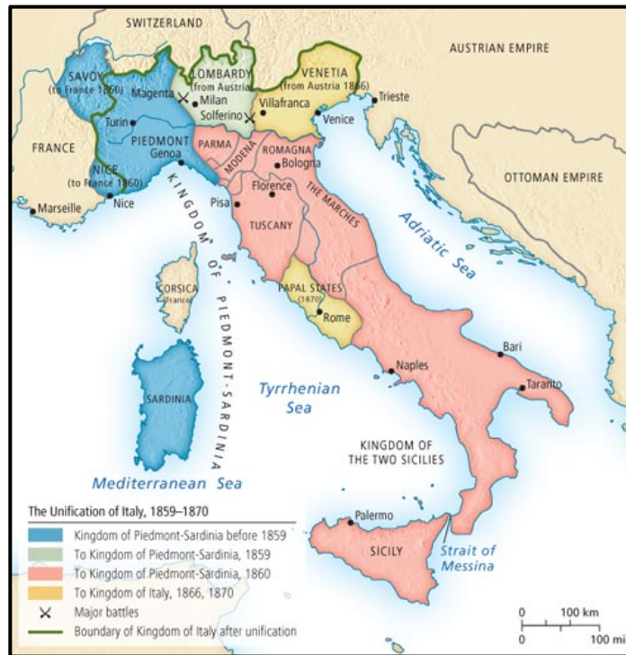
Figure 1: Italian Unification 1859-70, map available at Pearson Education, Inc. 22

Similarly, the 19 th Century nationalist movement driving the unification of German states that began under Bismarck was completed after the defeat of France in the Franco-Prussian War in 1871, where it was (ironically) proclaimed in the Hall of Mirrors at the Palace of Versailles outside Paris. Thus, Germany was consolidated into a large, basically homogenic nation-state. The expansionist form of Pan-Germanism did not arise until many years after this consolidation took place. Lebensraum, or “living space” for the German people, conceptually took hold in the late 19th century and was given expression as an official policy goal of Imperial Germany by Chancellor Theobald von Bethmann-Hollweg (1909-1917). After their defeat in World War I, German nationalism, as such, became dormant until Hitler’s rise to power in the 1930’s.